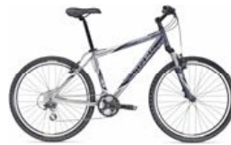
Trek Model 4300