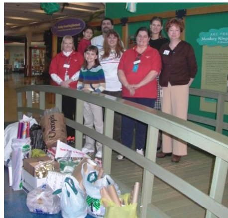
Bank of America employees donated over 20 bags of recycled art supplies to the Children's Museum.

The Museum's Art Studio regularly features common household items such as plastic tubs and lids, egg cartons, buttons, yarn and clothes that visitors use to create art. Many of these items are not recyclable in CVWMA programs, so we teamed with the Museum for a supply drive to collect these needed items for the Art Studio. At the event, museum visitors made handmade recycled paper in the Art Studio along with all kinds of other creations using the Studio's supplies. The kid's kitchen featured a "recycled" snack of bread pudding that participants made and then enjoyed