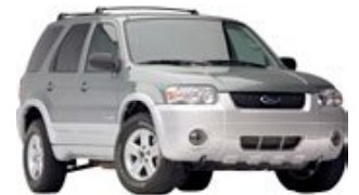
Ford Escape Hybrid SUV