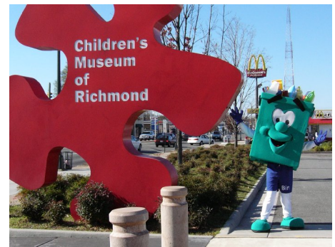
Our mascot "Bin" poses in front of the Children's Museum.

and people signed up for the America Recycles Day pledge contest. On Saturday November 13th, CVWMA partnered with the Children's Museum of Richmond for a family festival about recycling, complete with children's recycled art activities.