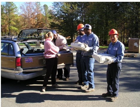
At three area collection events over 8 tons of electronics were collected.

Central Virginia Waste Management Authority responded to this region's need to recycle electronics and in November began an ongoing program to help residents safely dispose of unwanted electronic equipment. Three Saturday collections were held during the month in Richmond, Henrico and Chesterfield. In all, 204 vehicles attended and 16,678 pounds of materials were collected, including 206 televisions and computer monitors.