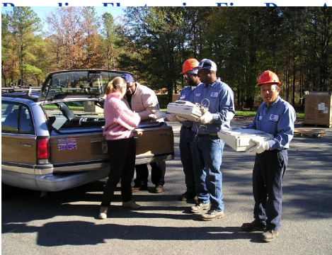
At three area collection events over 8 tons of electronics were collected.

Central Virginia Waste Management Authority responded to this region's need to recycle electronics and in November began an ongoing program to help residents safely dispose of unwanted electronic equipment. Three Saturday collections were held during the month in Richmond, Henrico and Chesterfield. In all, 204 vehicles attended and 16,678 pounds of materials were collected, including 206 televisions and computer monitors.