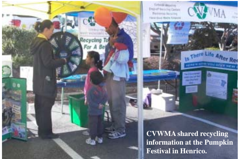
CVWMA shared recycling information at the Pumpkin Festival in Henrico.

America Recycles Festivities and Prizes- Full Story on Page 2